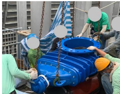
Installing the gate valve on the fittings