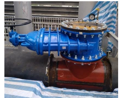
Conduct the pressure test