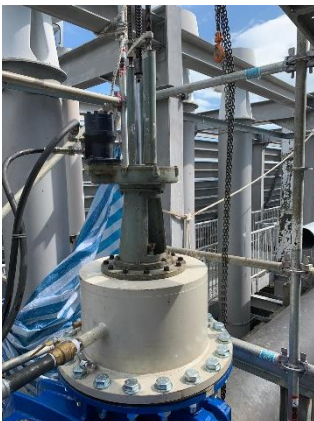
Install Hot tapping machine to coring