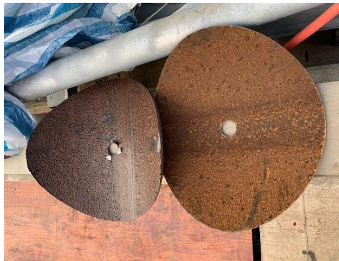
Retain coupons with smooth cutting edge from pipe