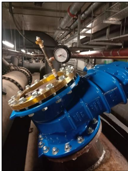
Pressure Test after welding works