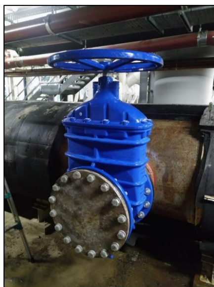
Tie-in Operation Completed