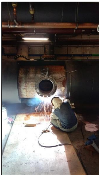
Pipe Spool Installation