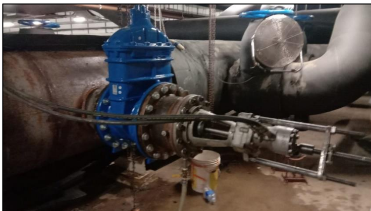
Hop Tap Operation