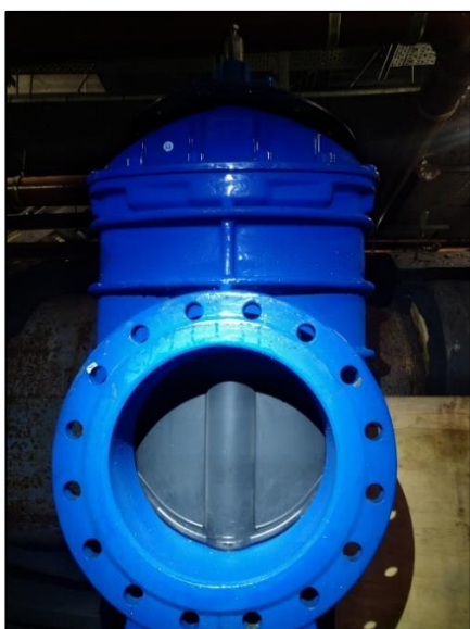
Valve Close after hot tap