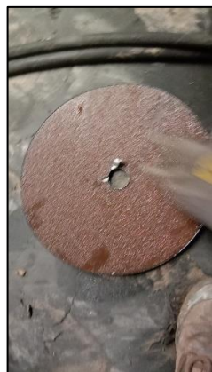
Hop Tap Coupon